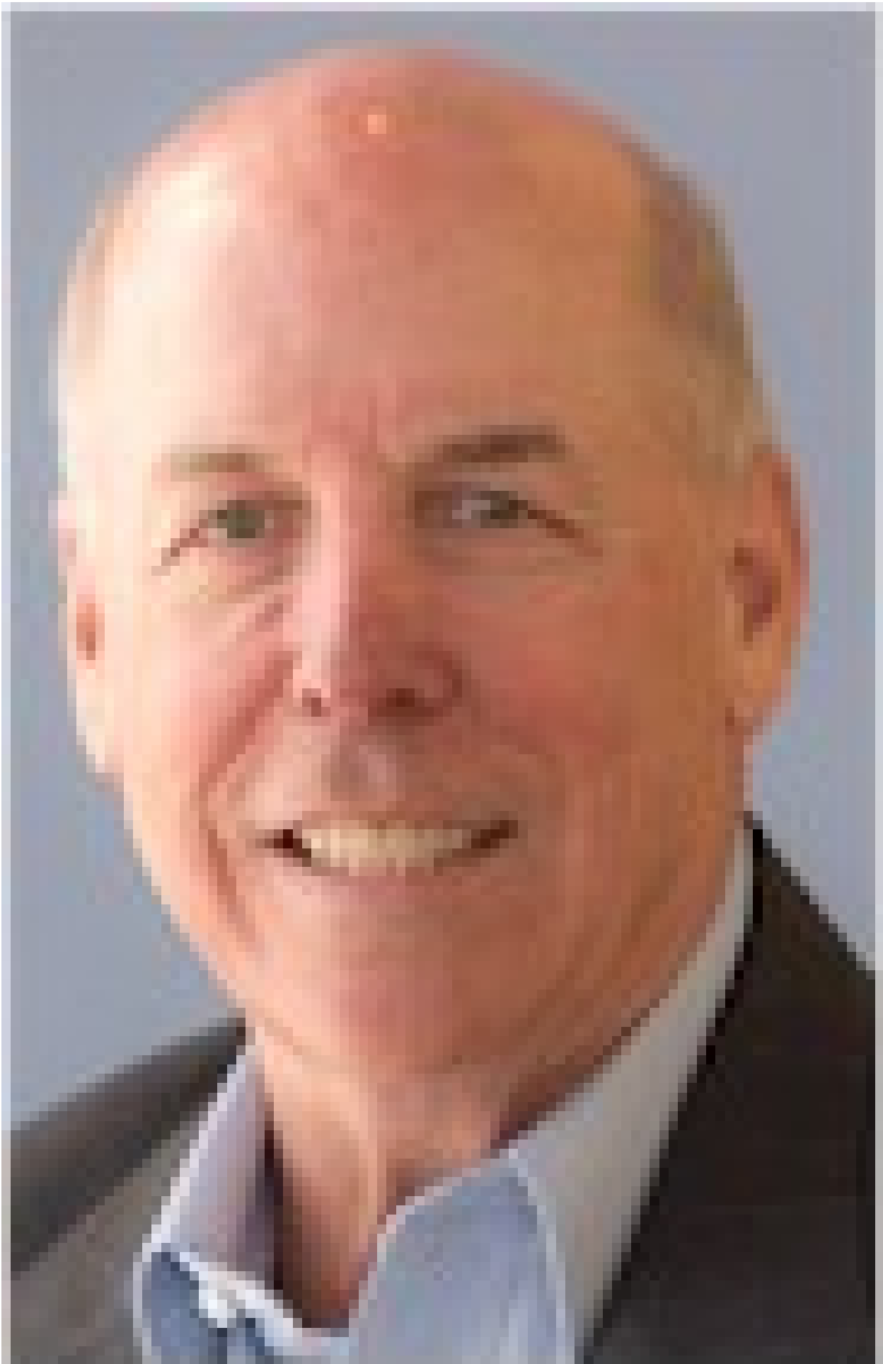
Mr. [Name] is a [Title] at [Company]. He has [Experience] years of experience in [Field].