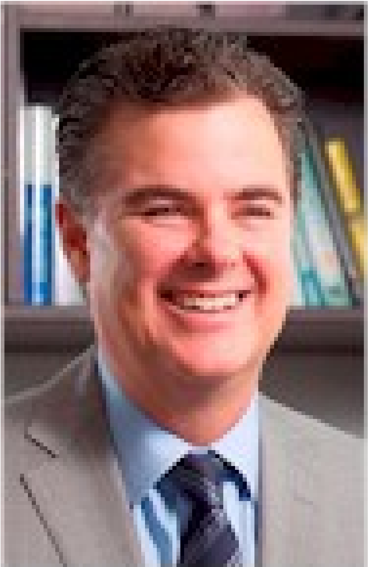
Dr. [Name] is a [Title] at [Institution]. He is a [Field] expert and has published [Number] papers in [Journal].