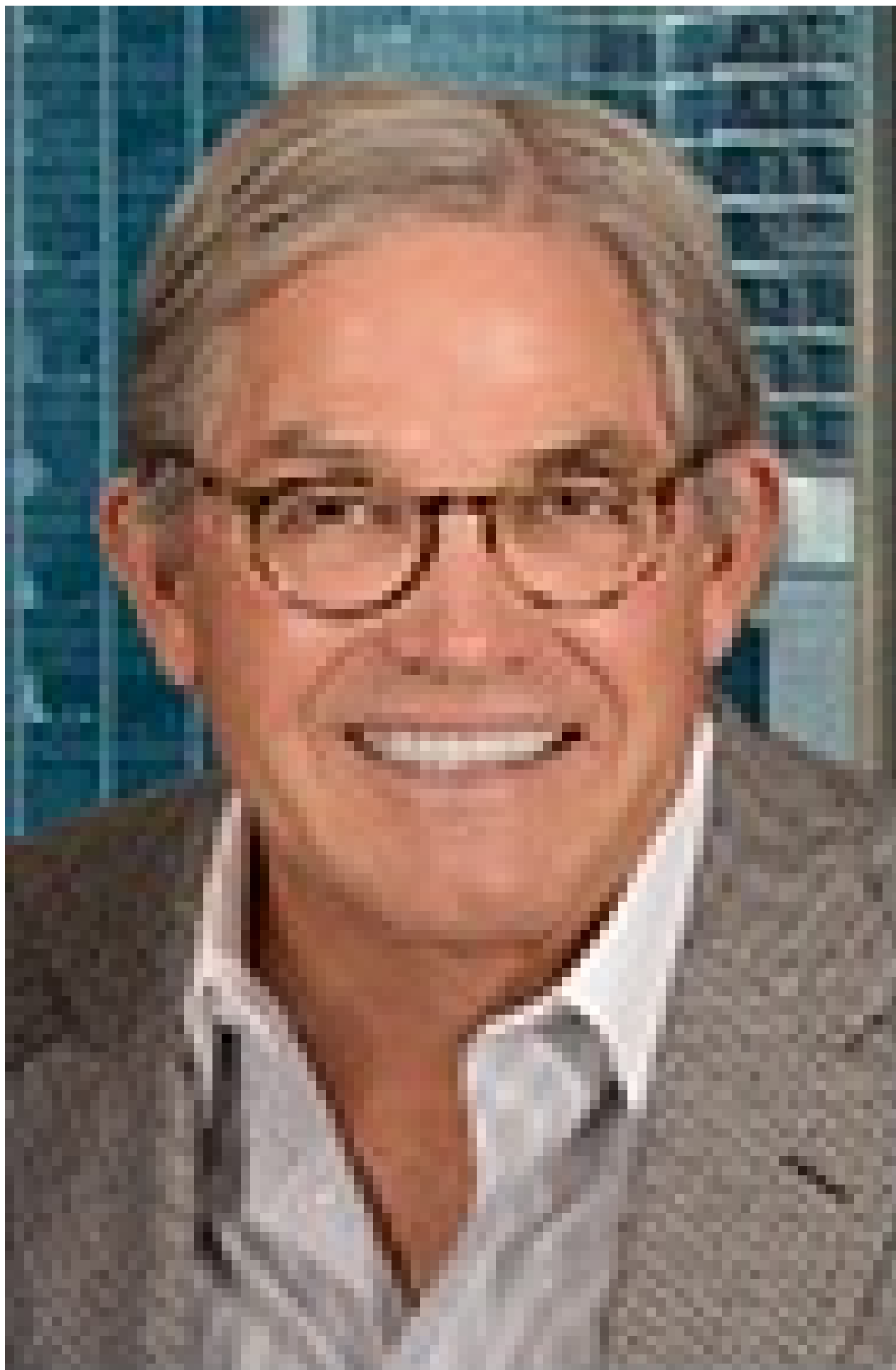
Mr. [Name] is a [Title] at [Company]. He has [Experience] years of experience in [Field].